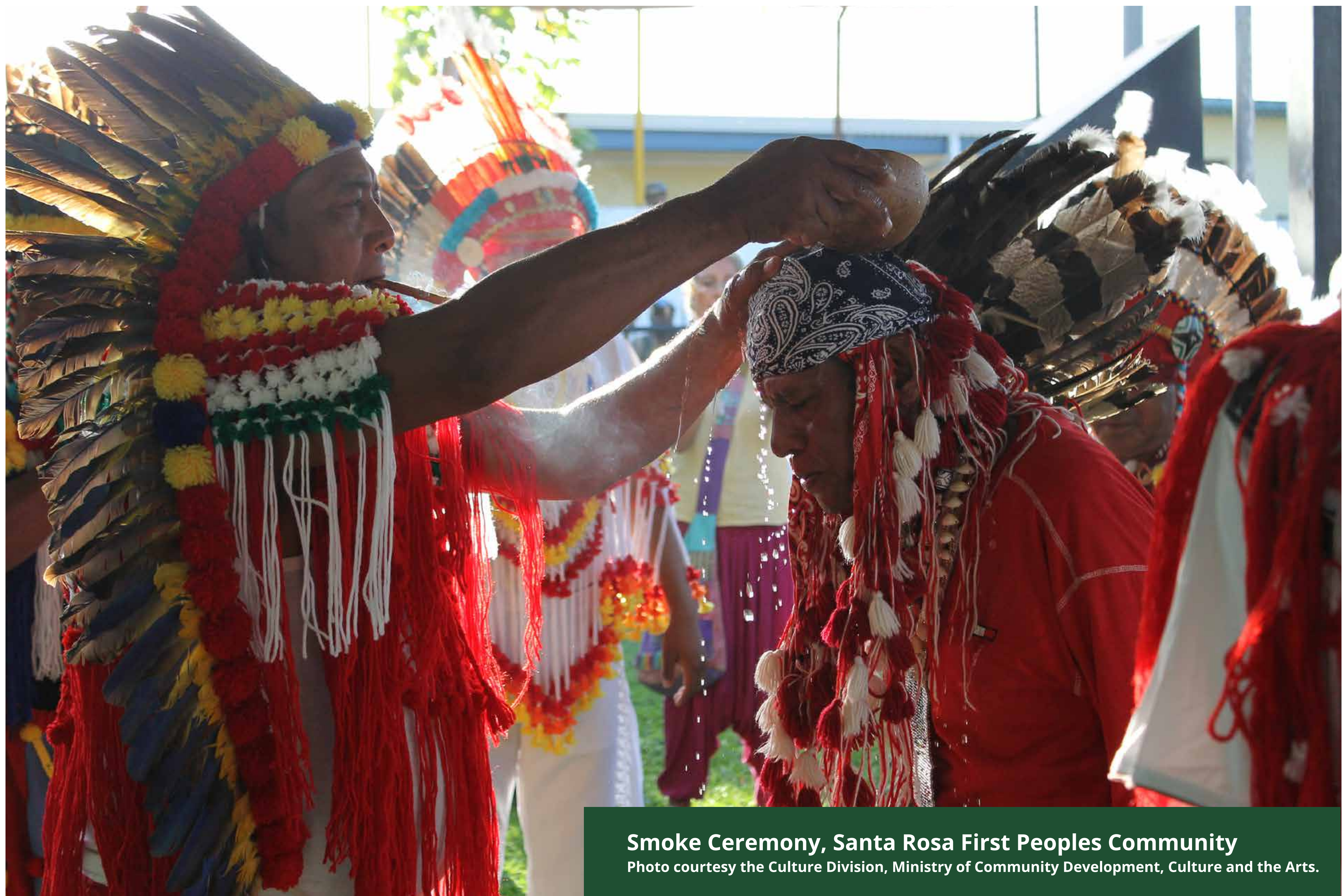
Smoke Ceremony, Santa Rosa First Peoples Community

The First Peoples carry a unique world view of life. They believe that there is a supreme force that energizes the earth, water, air and fire to create and perpetuate life forms. Everything is interconnected and to disturb one element is to disturb the life force. Like other First Peoples around the world, they are regarded as nature worshippers.