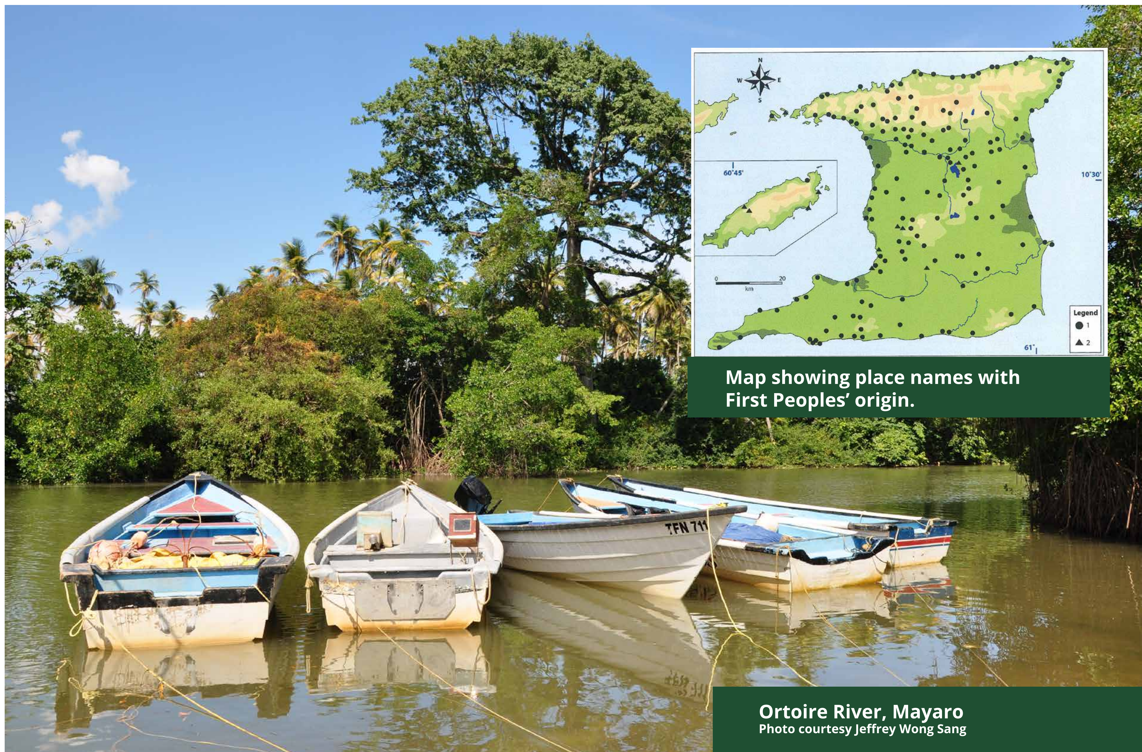
Map showing place names with First Peoples' origin.