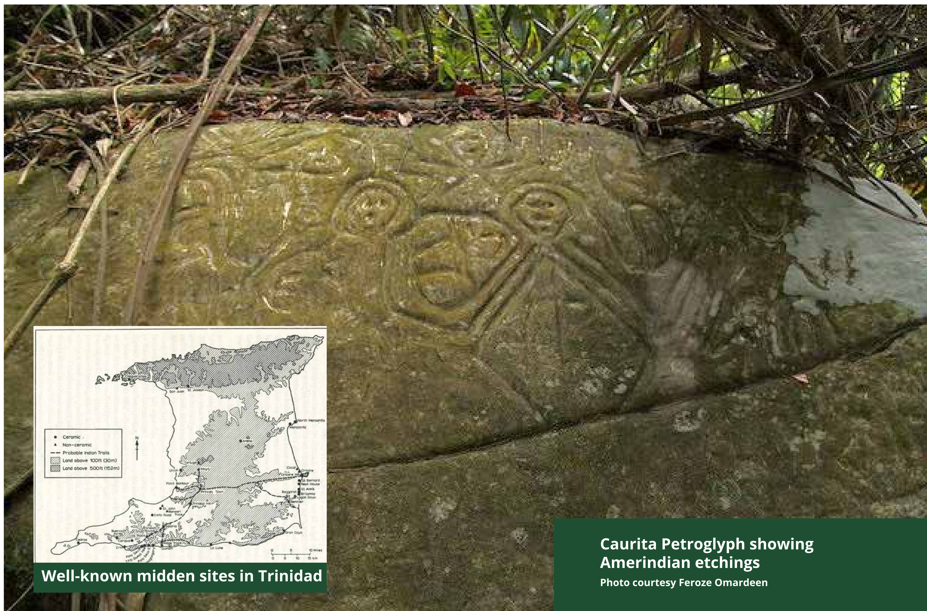
Well-known midden sites in Trinidad