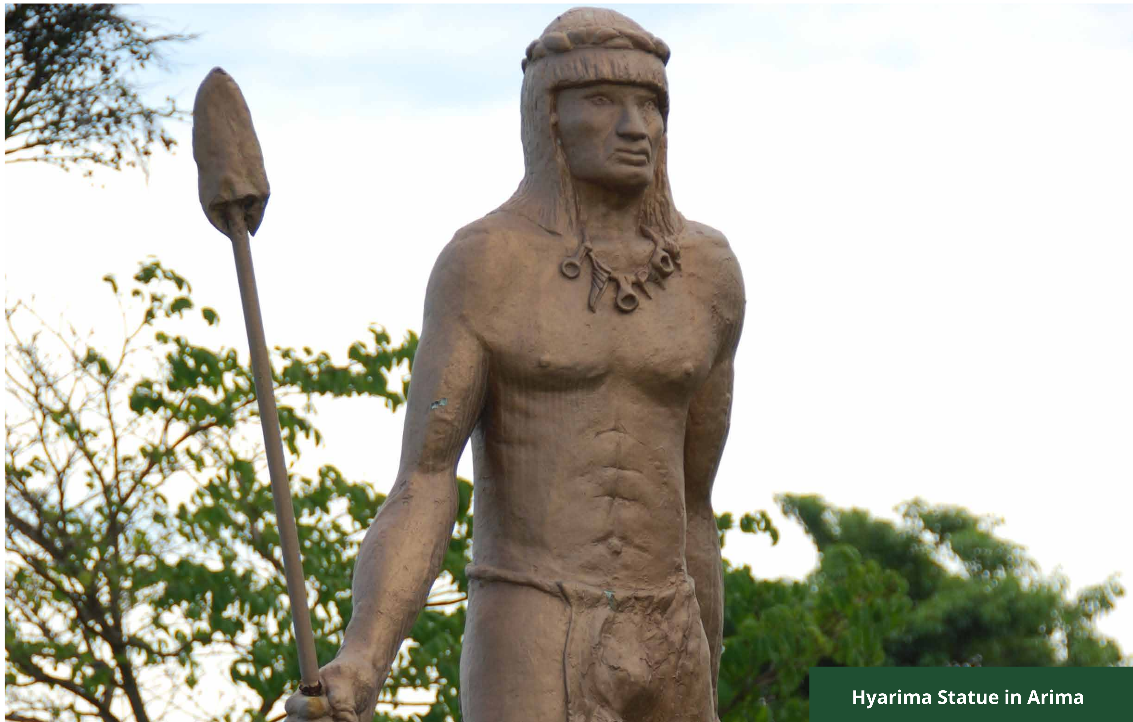
Hyarima Statue in Arima

Traditional First Peoples' society was disrupted after the Spanish and other Europeans got a permanent foothold on Trinidad and Tobago. But it was not without resistance. Chief Hyarima is one of the heroes of the First Peoples. He is known for his military prowess and his determination to rid his land of Spanish control.