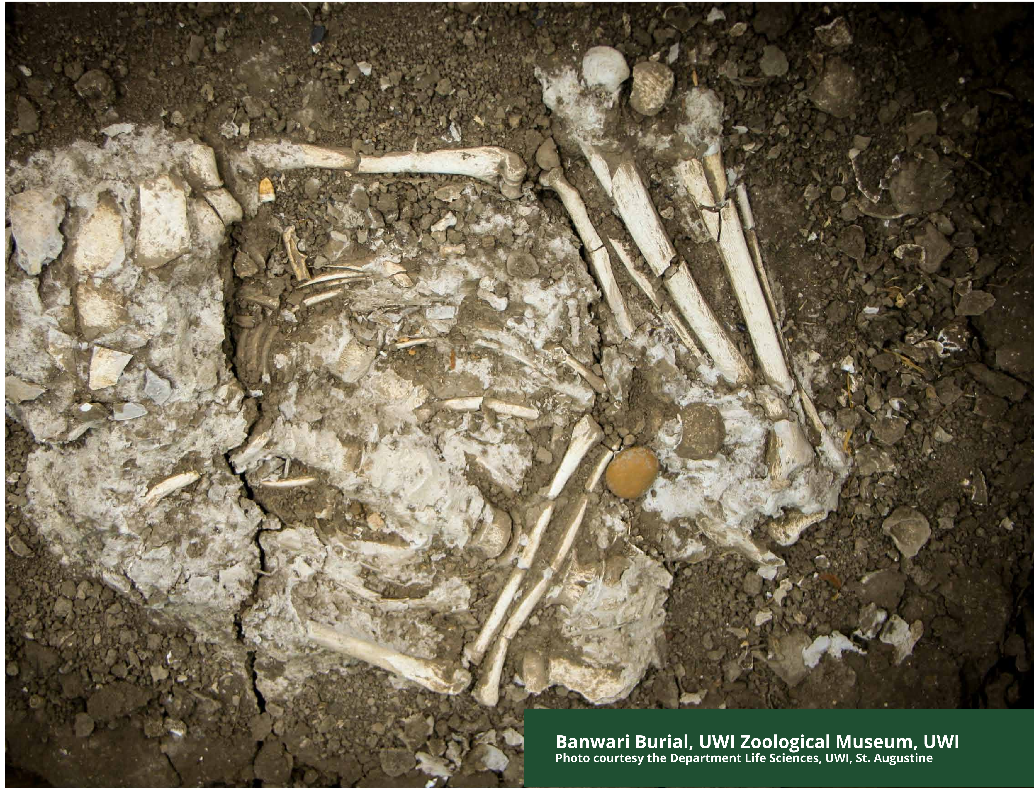
Banwari Burial, UWI Zoological Museum, UWI

Contrary to popular belief, Trinidad and Tobago was inhabited by several groups or First Nations. These groups belonged to three language families – Arawakan, Cariban and Warao.