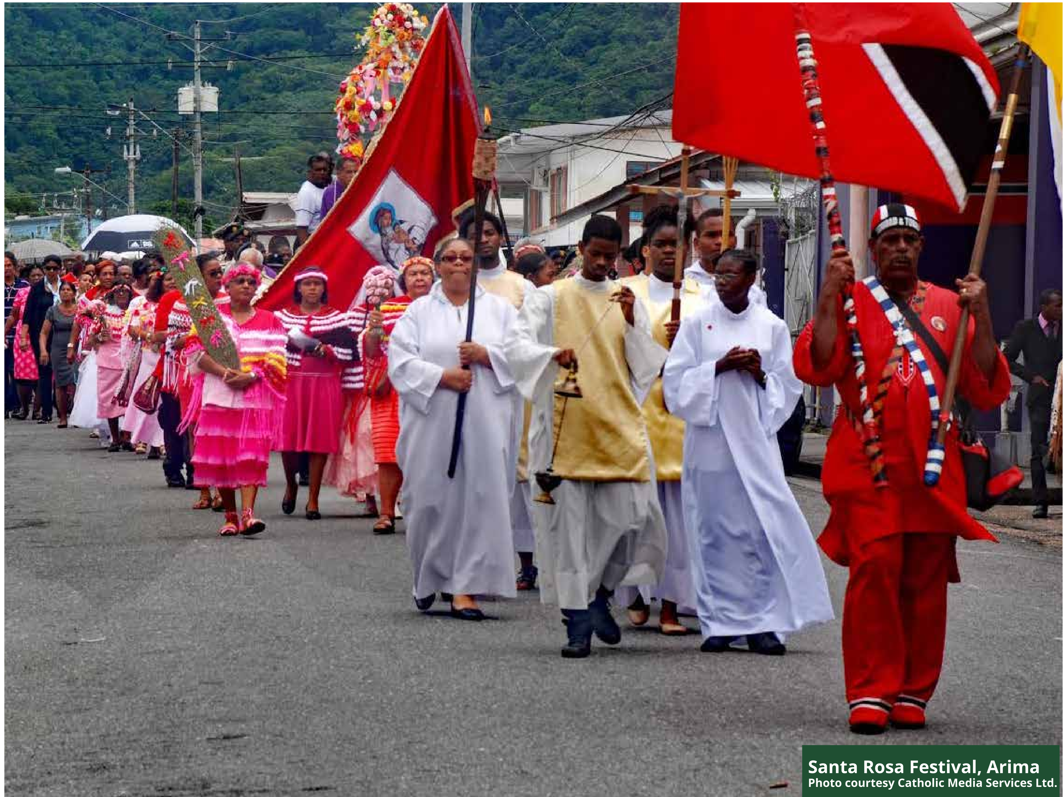
Santa Rosa Festival, Arima

Organized by the Santa Rosa First Peoples Community, the Santa Rosa Festival in Arima is the oldest continuously celebrated festival in Trinidad and Tobago. Its beginning can be traced back to 1786 when Arima was a mission village. It is held annually at the end of August in honour of the former mission's patron saint, St. Rose of Lima, the first saint of