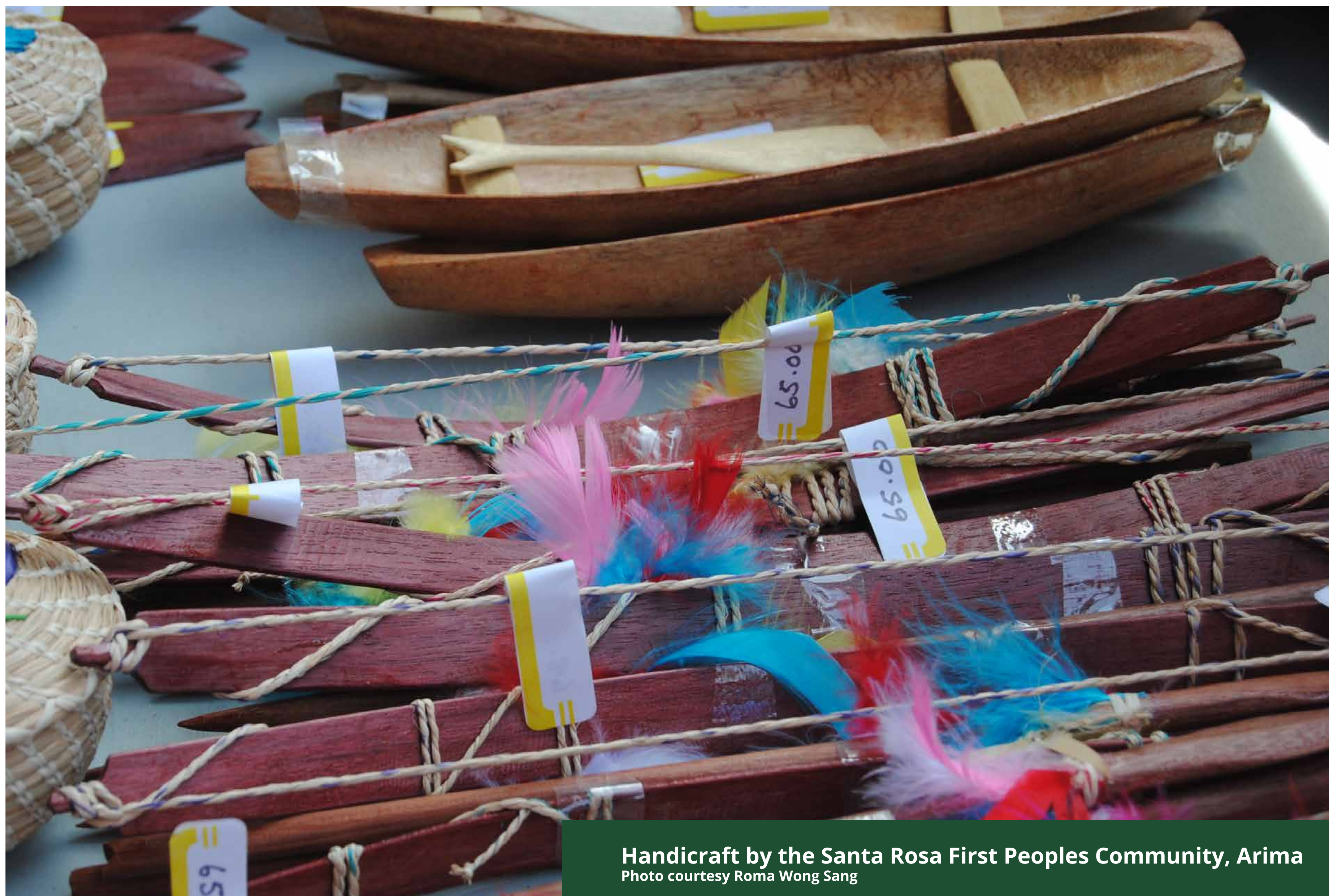
Handicraft by the Santa Rosa First Peoples Community, Arima

The Amerindians developed the canoe, bow and arrow, and ajoupa, and produce unique handicraft using natural materials. Their knowledge of medicinal plants and their use in the treatment of injuries and in the preparation of 'bush teas' for curing illnesses has been passed on through the generations.